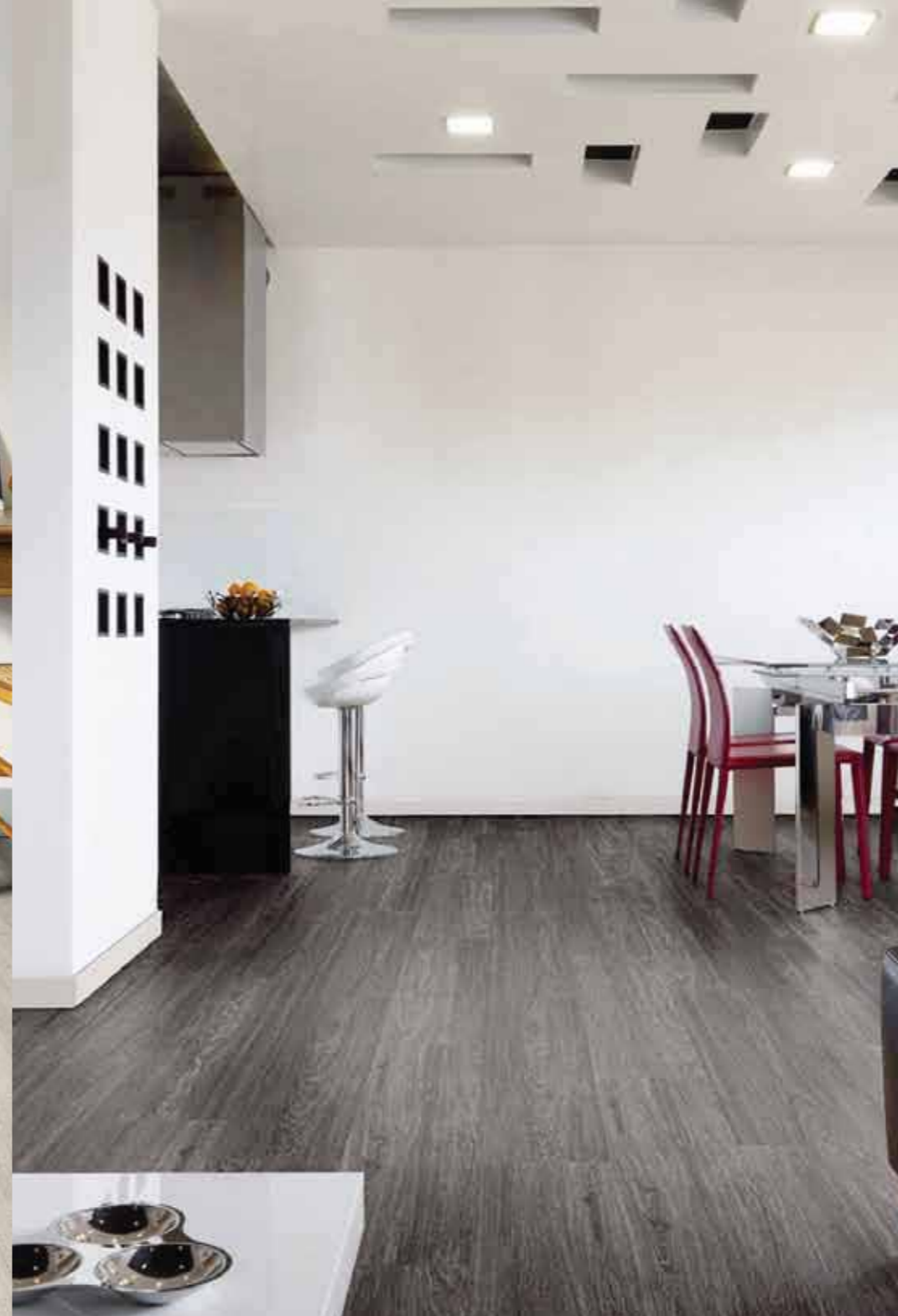
GREY BRUSHED OAK