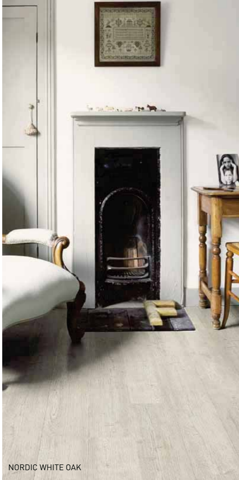
NORDIC WHITE OAK