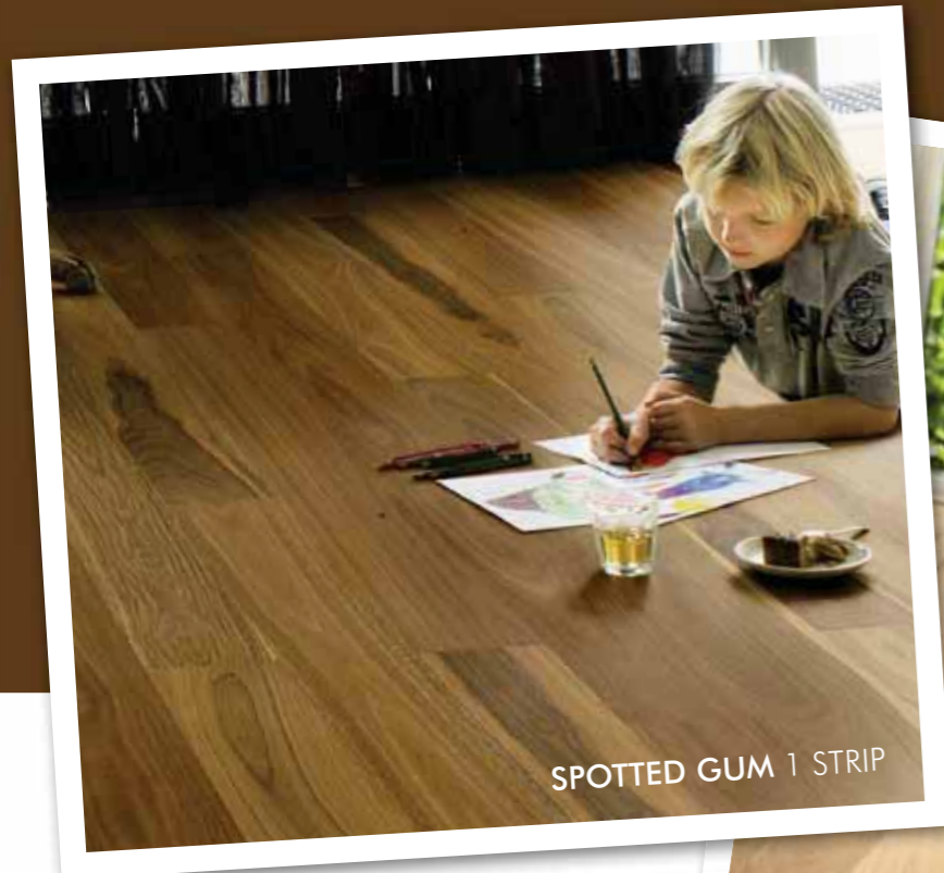
SPOTTED GUM 1 STRIP

Texture is the buzzword for flooring now with saw cuts, reclaimed finishes and industrial details set to trend. The all-new Spotted Gum and Blackbutt in Matt Brushed finish offers the beauty of the well-known and popular Australian species in a natural, rustic look. These designs are very different from their glossy siblings and more forgiving to scratches and wear.