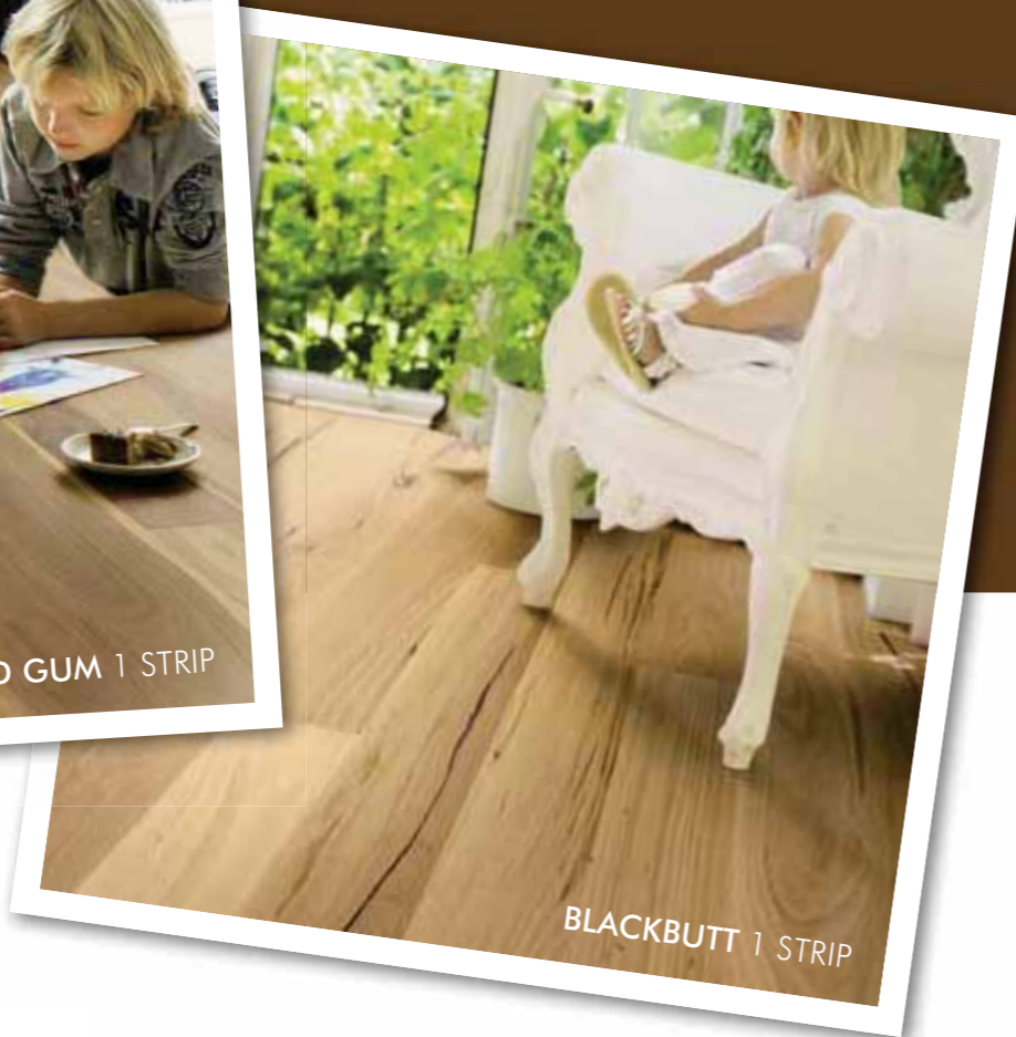
BLACKBUTT 1 STRIP